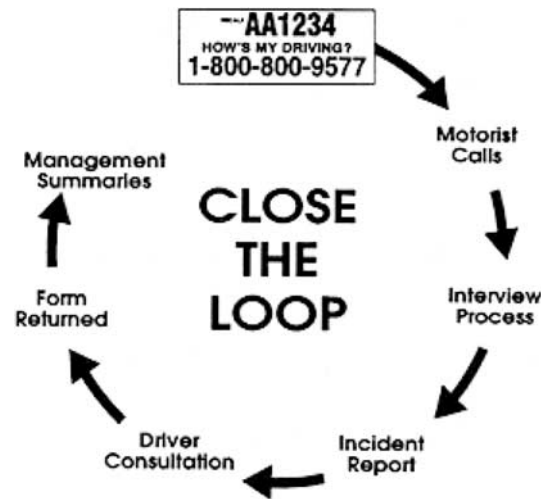
Figure 5. Feedback loop from an action report. Adapted from SafetyNet, Inc. (2002). www.fleetsafe.com

On-board recording includes two approaches: OBSM of safety-related driving behaviors (e.g., speed, acceleration, braking force), with feedback to drivers and managers and event-data recorders that also monitor driver safety behavior and performance, but which are primarily accessed after a crash or incident to determine and document driver behavior